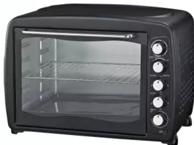
RICE COOKER MICROWAVE OVEN ELECTRIC OVEN