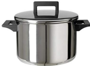
SAUCE / SOUP POTS