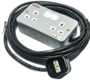
ELECTRIC STEAMBOAT with extension wires